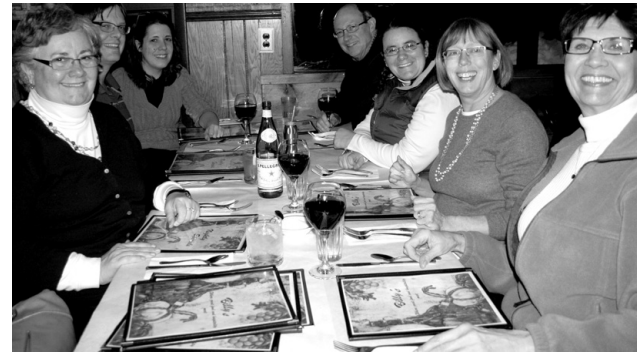
On March 1, members of View, our local arts center, supported the library benefit at Billy's Restaurant. We want to thank them and the many other diners who came out that evening.